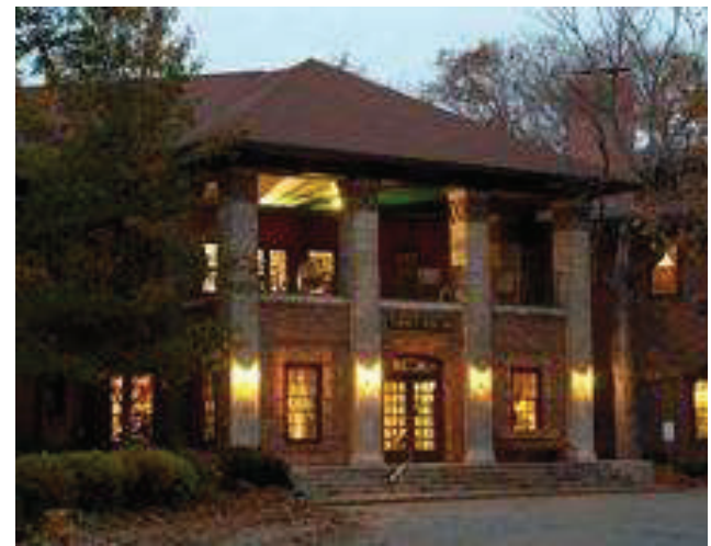
Embrace the hospitality at our cozy inn, built in 1919.

"Twenty years from now, you will be more disappointed by the things you didn't do than by the ones you did do ... Explore. Dream. Discover." ~Mark Twain