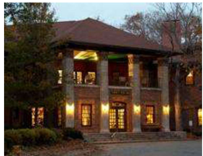
Embrace the hospitality at our cozy inn, built in 1919.

"Twenty years from now, you will be more disappointed by the things you didn't do than by the ones you did do ... Explore. Dream. Discover." ~Mark Twain