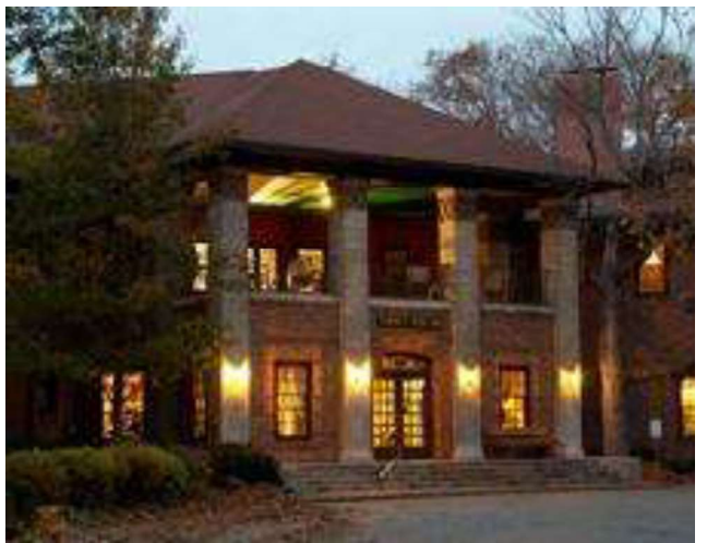
Embrace the hospitality at our cozy inn, built in 1919.

Questions: Call 847-381-9374 or email TrailboundTrips@gmail.com .