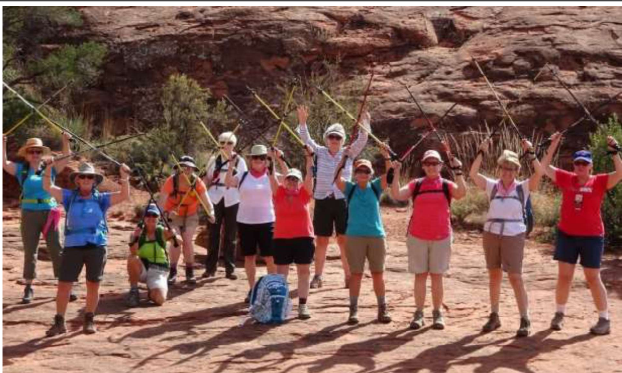
Come join a tribe of like-minded outdoor adventurers!