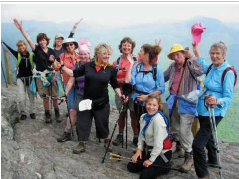
Greet morning with vistas on Whiteside Mountain and the warmth of friendship.

Check here if you'd like a solo room upgrade at Pisgah Inn for an additional $525.