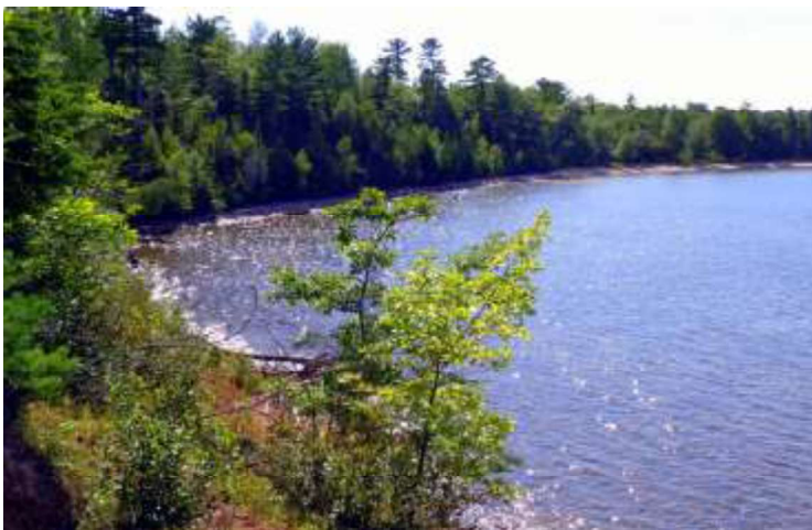
Enjoy the trail views on Madeline Island