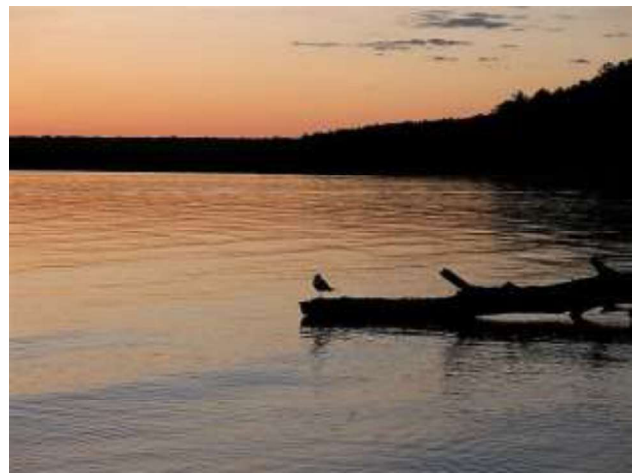
Get back to nature