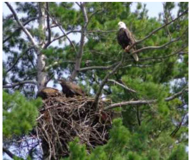
Look for eaglets in their nest