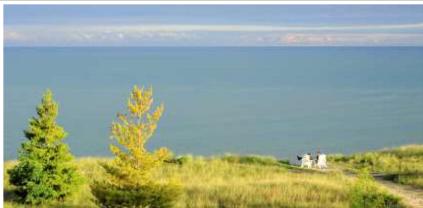
Reconnect with nature...with a friend...with yourself.