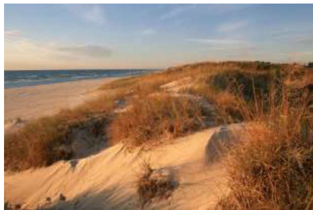
Hike across Lake Michigan's rolling dunes...