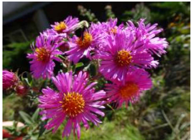
...and amid fall's gorgeous colors.