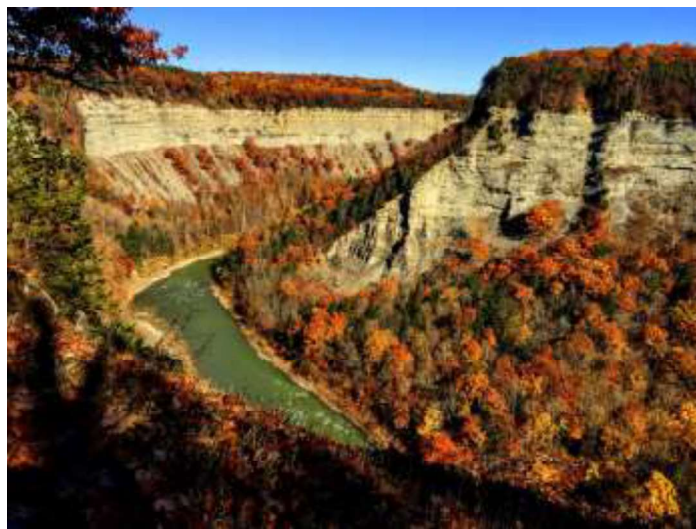
Hike along this canyon, and then raft through it!