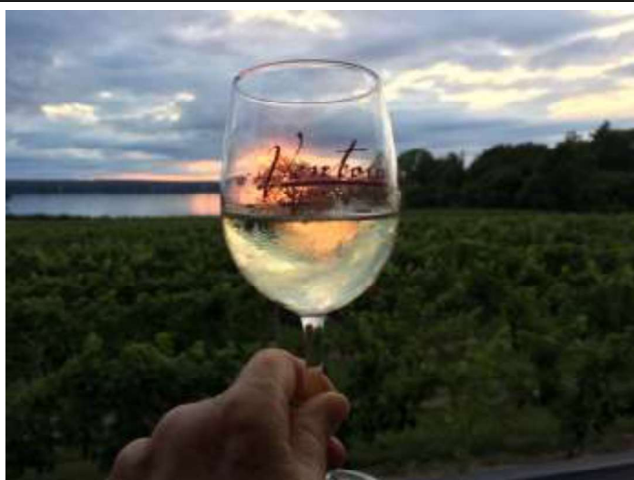
Relax. Renew. Rejuvenate. Repeat.